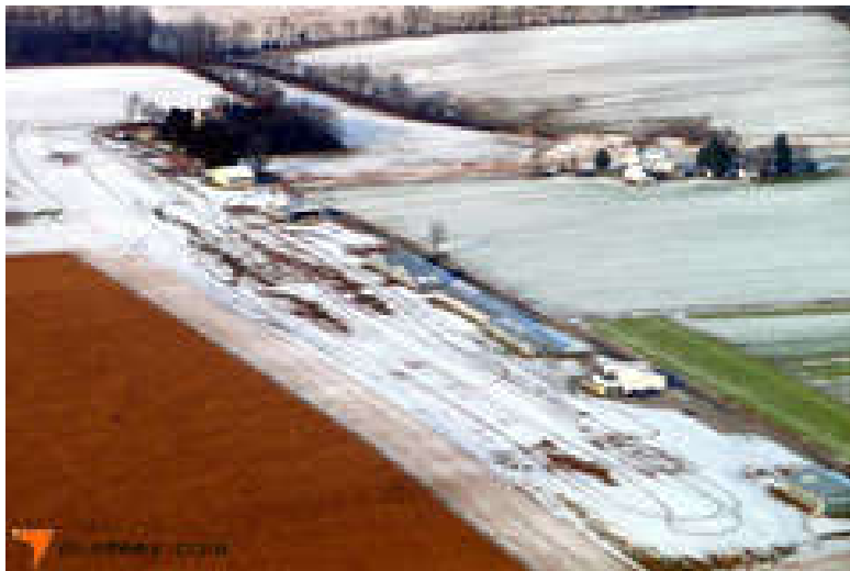
Bermudian Valley Airpark